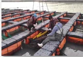
Floating fish cage