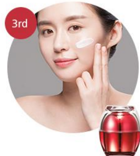
Pozzlan MIRACLE CREAM